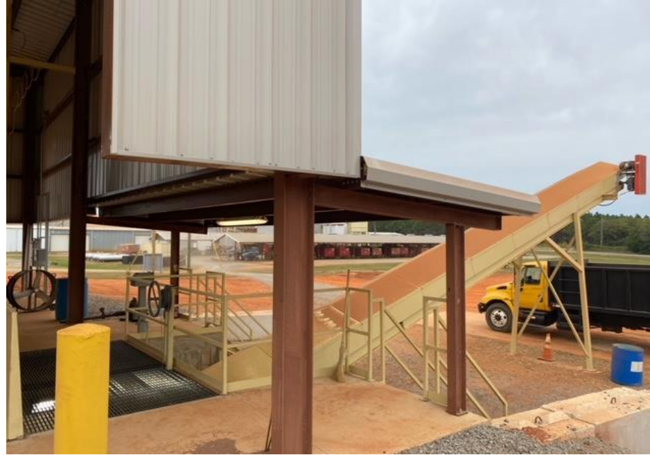
Transfer Station 2023