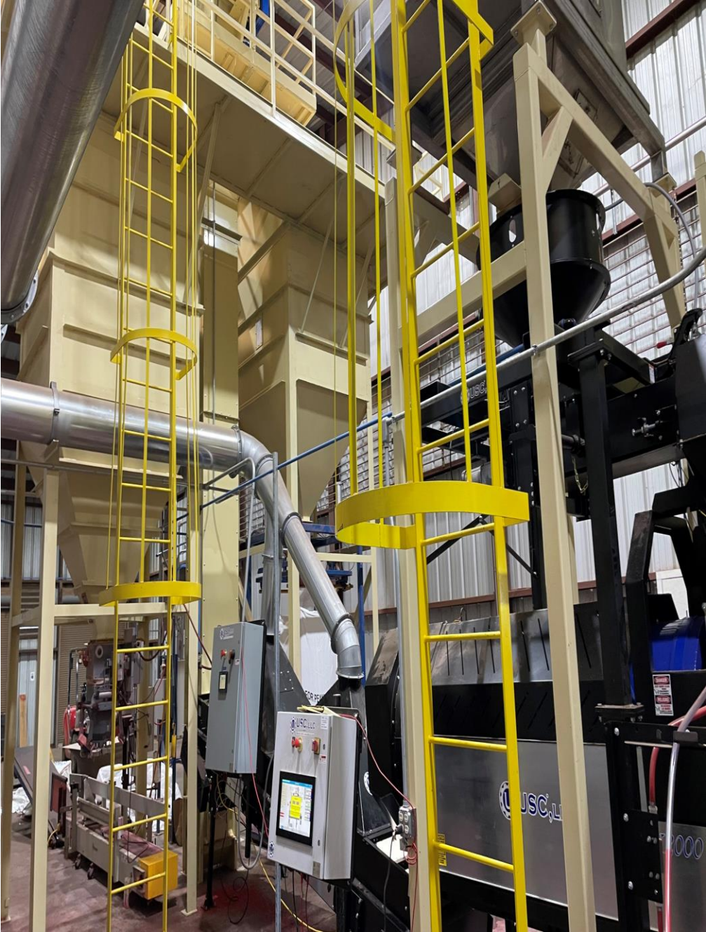
Liquid Peanut Treater 2024