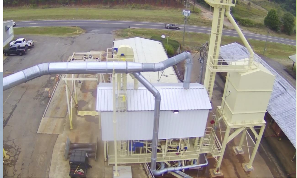
Small Air-Gap - 2022